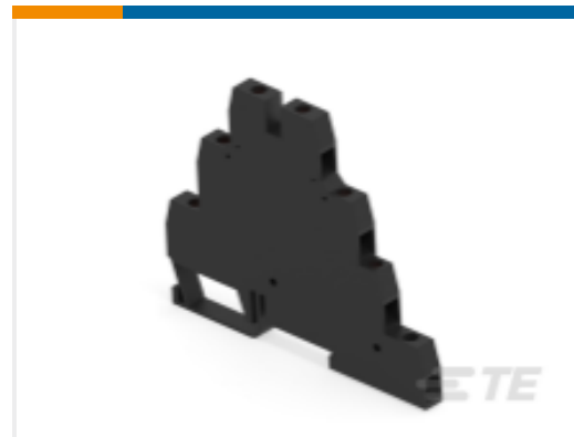
TE Part #1SNA199219R0300 D4/6.T1