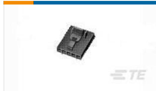
TE Part #104257-5 06 MTE RCPT HSG SR LATCH .100