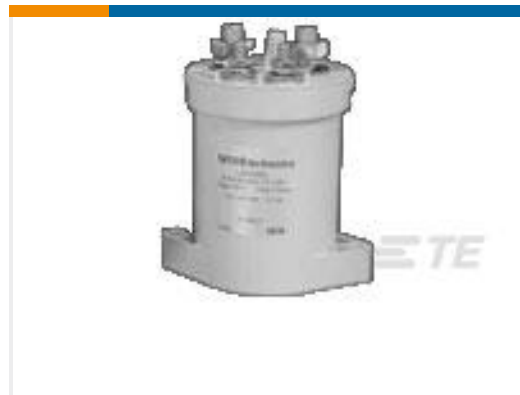
TE Part #5-1618388-8 LEV200A6NAA=RELAY, SPST-NO