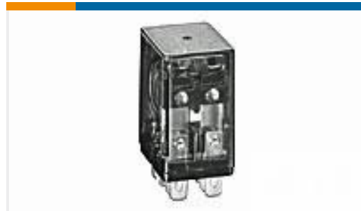
TE Part #5-1393144-7 K10P-11D15-24=K10/K20