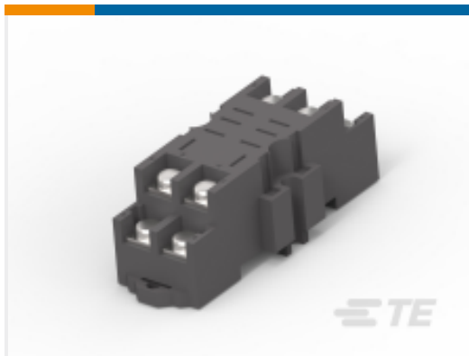
TE Part #2-1419106-7 27E895=SOCKET,K10,8,OC,POLY,NA