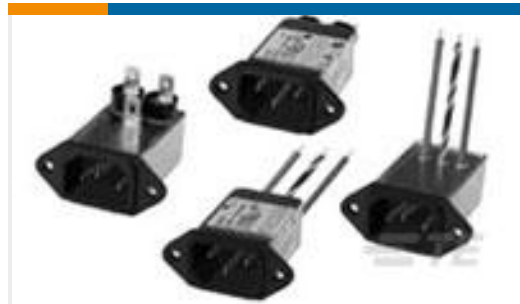
TE Part #6609017-9 6EC1=F7284 S0