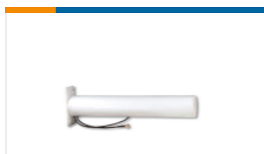
TE Part #YE240015 YAGI,EC,15,2.4-2.5GHz 20,11.2dBi