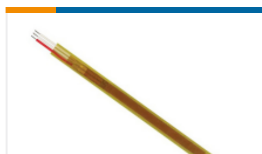
TE Part #R-8204 RTD,STRR,P100,385,.5%,.030T,H