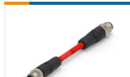
TE Part #TAD14741311-150 M12D4-MS-MS-PVC TYPE B RED-15.0 M