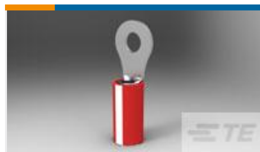
TE Part #51863-4 TERMINAL,PIDG R IR 18 6