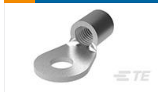
TE Part #33465 TERMINAL,SOLIS R 6 1/4