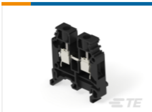
TE Part #1SNA400239R1500 M6/8