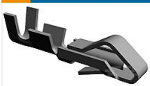
TE Part #640252-2 SL-156 RECEPTACLE