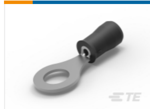
TE Part #35787 PIDG Ring Tongue Terminals