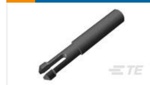
TE Part #1-640415-0 UMNL KEYING PLUG V0