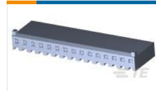
TE Part #1-770849-5 15P SL156 HSG W/LOC RAMP W/TBS