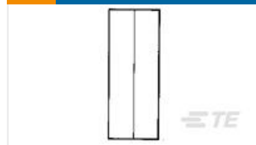
TE Part #36946 SPLICE,SOLIS PARA 1/0