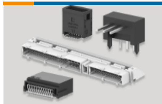
PCB Headers & Receptacles(440)