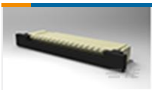
TE Part #2-84953-0 1MM FPC HORZ.TOP CONT.ASSY 20P