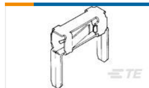
TE Part #86434-1 MOD I RECP LP