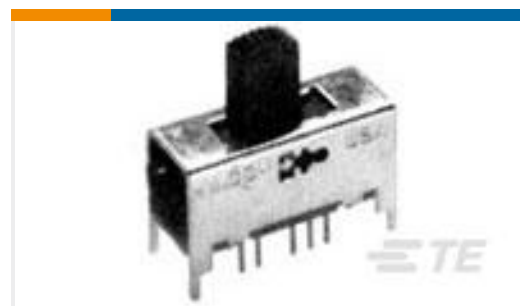
TE Part #1825200-1 MSSA245004=SW SLIDE, DP4T AG