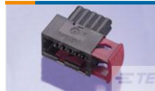
TE Part #967558-1 J-P-T GEH 24P,ASSY