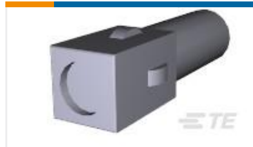
TE Part #350865-1 01P UMNL PLUG HSG