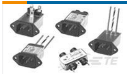
TE Part #6609013-7 15EH4=F7697 S0