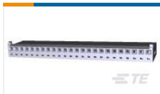
TE Part #2-1375820-4 CST-100 II HOUSING 24 POS