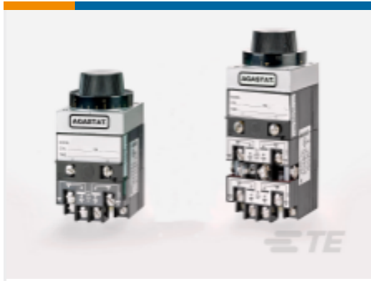
TE Part # 2-1423159-3 7012PC=RLY,STD,ON,2P,125VDC,15