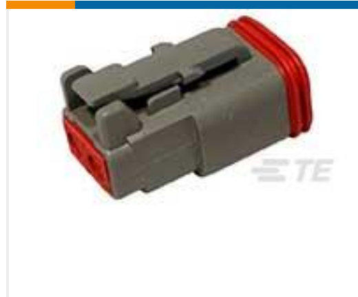
TE Part #DT06-2S PLG, 2P, GRY, N