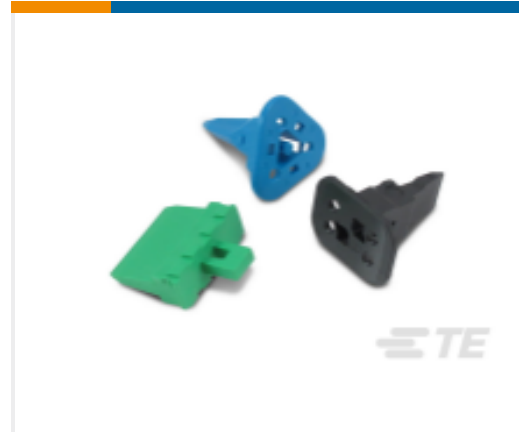
TE Part #W2S Wedgelocks: DEUTSCH DT