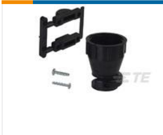
TE Part #206070-8 CABLE CLAMP KIT #17