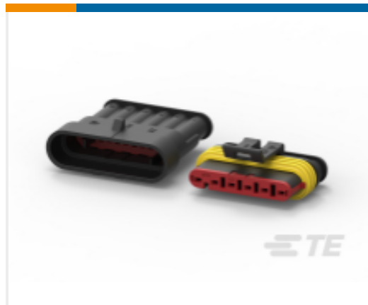
TE Part #282104-1 AMP SUPERSEAL 1.5MM, CONNECTOR HOUSING