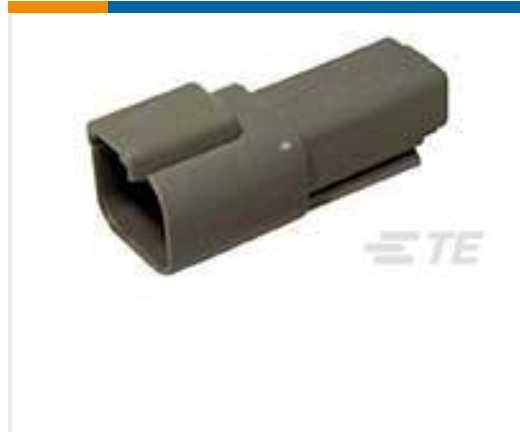
TE Part #DT04-2P REC, 2P, GRY, N