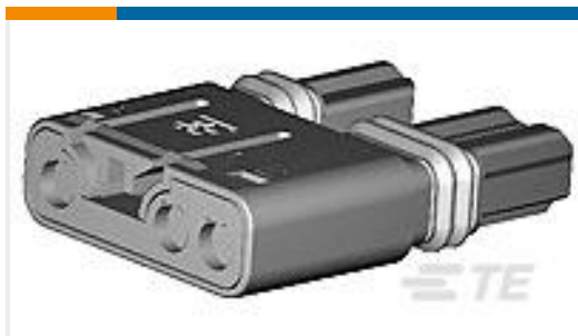
TE Part #2106135-3 Assembly, Plug, 3-Position