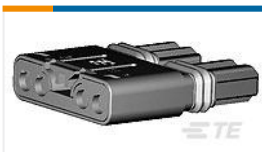
TE Part #2106135-4 Assembly, Free Hanging Plug, SLC, 4 pos