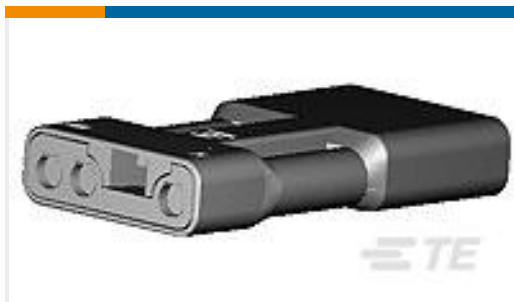
TE Part #2106136-3 Assembly, Receptacle, 3-Position