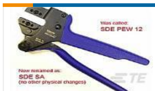
TE Part #9-1478240-0 SDE SA PEW12 HAND TOOL FRAME-NO DIES