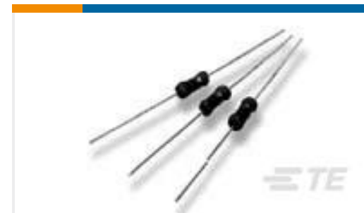
TE Part #3-1625892-6 3W SM M/OX 5% 27R