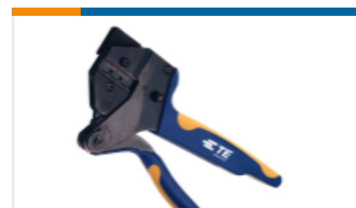
TE Part #2063957-1 SDE COMMERCIAL TOOL & DIE