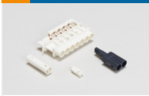
Plug & Socket Lighting Connectors(33)