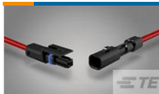
TE Part #2154854-1 SlimSeal Assembly, Plug, 1 position