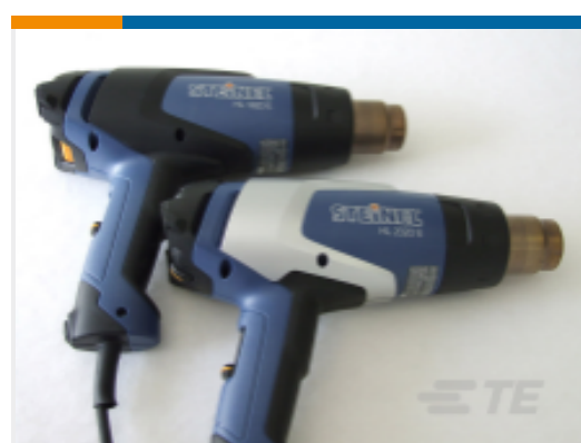
TE Part # EG8162-000 HL1920E-230V-EURO