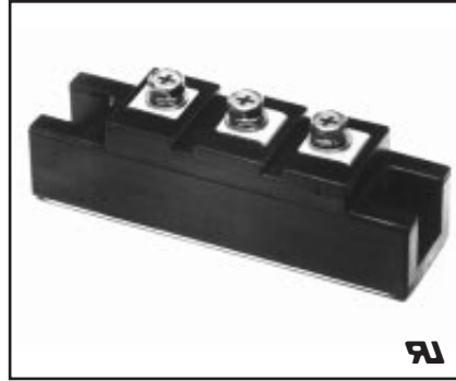
CDD10810 Dual Diode POW-R-BLOK™ Modules 100 Amperes/800 Volts