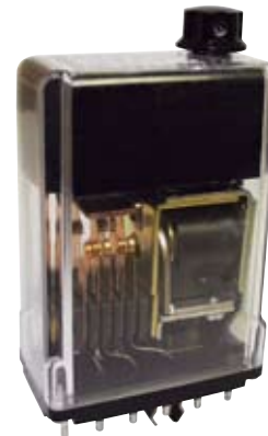
Industrial Pin Out