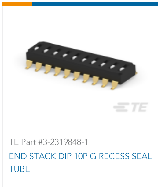
TE Part #3-2319848-1 END STACK DIP 10P G RECESS SEAL TUBE