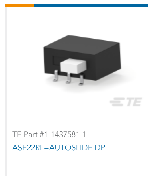
TE Part #1-1437581-1 ASE22RL=AUTOSLIDE DP