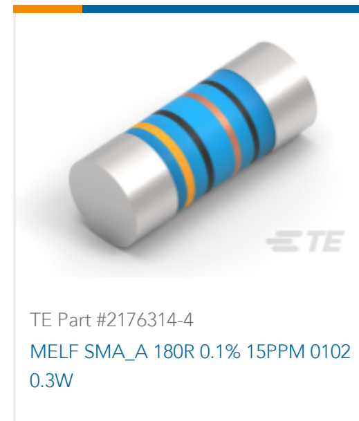
TE Part #2176314-4 MELF SMA_A 180R 0.1% 15PPM 0102 0.3W