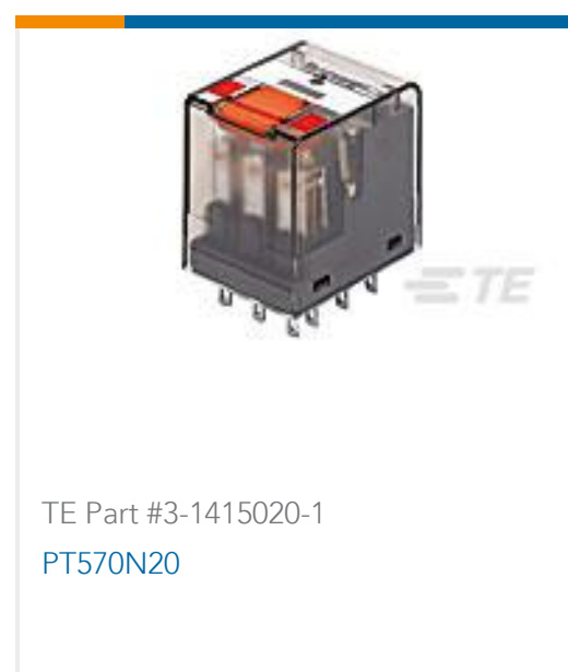
TE Part #3-1415020-1 PT570N20