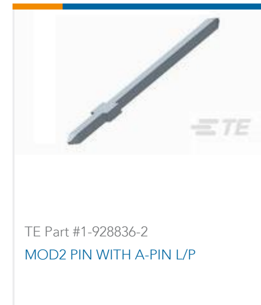
TE Part #1-928836-2 MOD2 PIN WITH A-PIN L/P