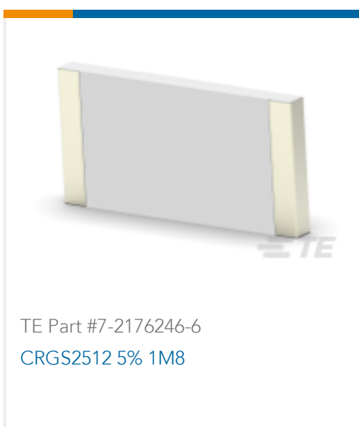
TE Part #7-2176246-6 CRGS2512 5% 1M8