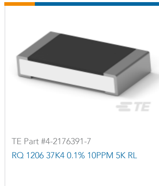
TE Part #4-2176391-7 RQ 1206 37K4 0.1% 10PPM 5K RL