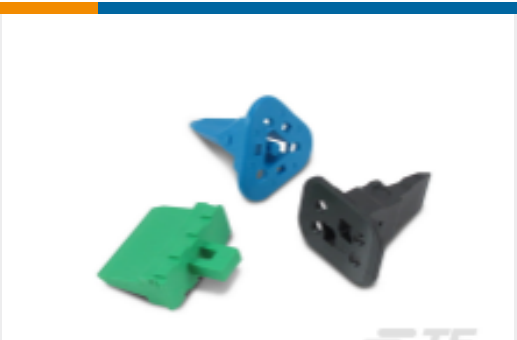
TE Part #W2S WedgeLocks: DEUTSCH DT