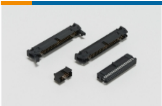
Ribbon Cable Connectors(525)