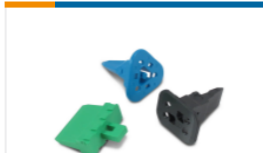
TE Part #W2S WedgeLocks: DEUTSCH DT