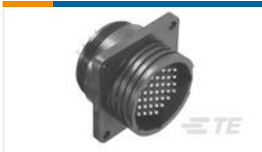
TE Part #1-796433-1 CPC POSTED RCPT,13-7 LF