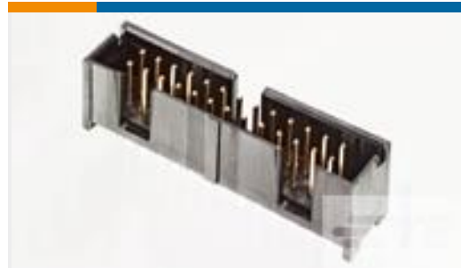
TE Part #1-5103308-3 A/L LOW PRO HDR 24P VERT BLACK