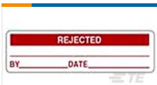
TE Part #1878653-3 QC130