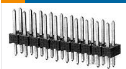
TE Part #9-146250-0 80 MODII HDR DRST B/A .100CL