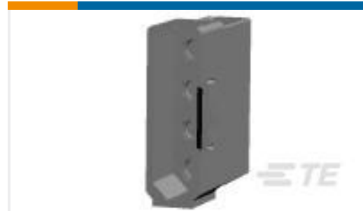
TE Part #770336-1 04P .093 COMM P&S PLUG .250CL