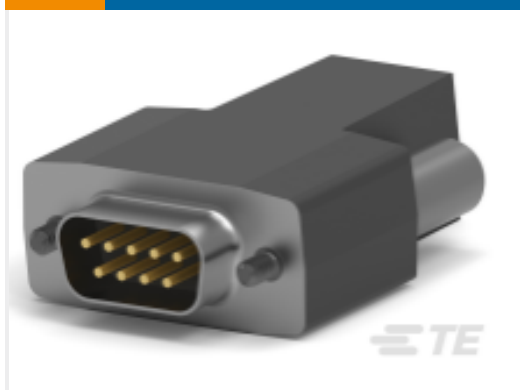
TE Part # 1-747944-6 KIT,PLUG,9P,HDE,SHLD ENCLSR