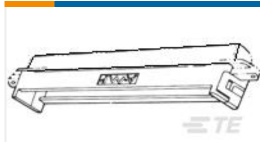
TE Part #1-552296-1 STRAIN RELIEF 64 POS BLACK