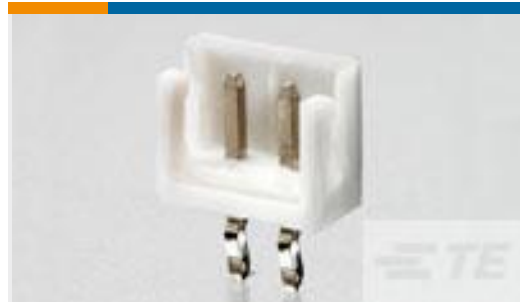
TE Part #440052-3 2.5MM,HDR,3POS,VERTICAL, CONNECTOR