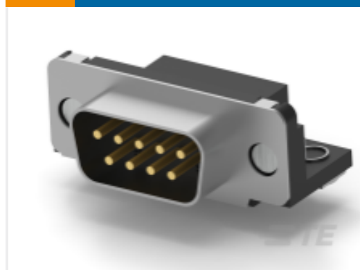
TE Part # CAT-023-DPARS1274 D-Sub Plug Assembly: Standard, Right Angle, Shell Size 1, 2.74mm