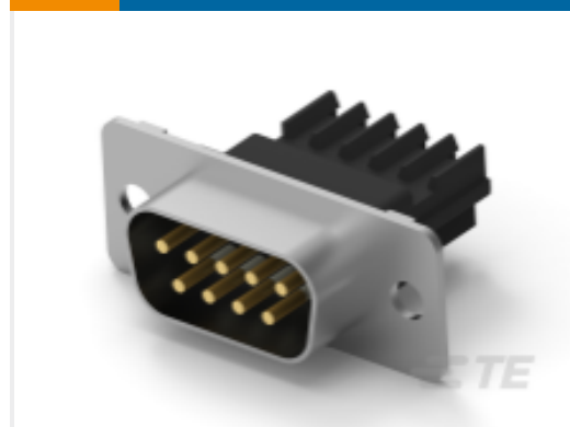
TE Part # 2-745492-0 PLUG ASSY,9P,HDE,MS