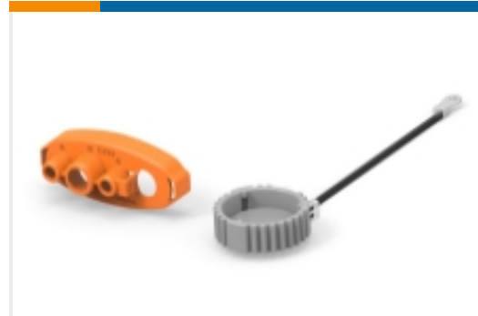
Connector Caps & Covers(69)