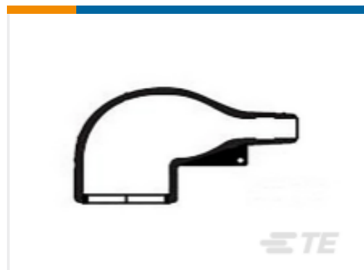
TE Part #EF9981-000 222K121-25L/225-0