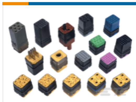
TE Part #ZPF000000000148762 DMC-M 99-04 AN (=33537-P0000)