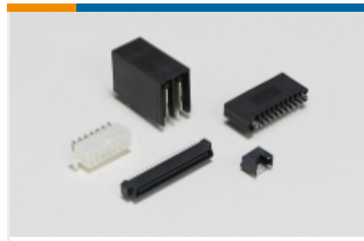
Standard Rectangular Connectors(495)