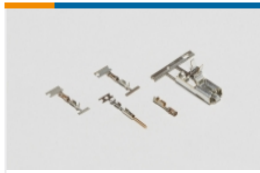
Wire-to-Board Connector Contacts(8)