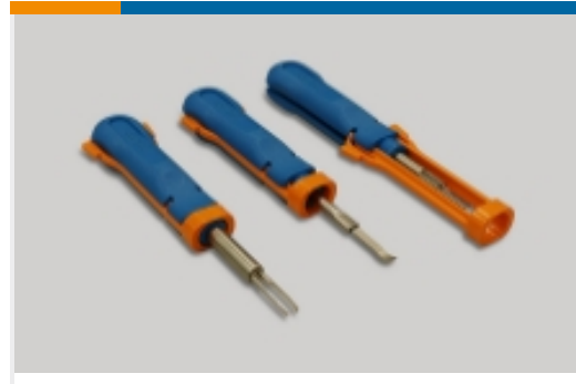
Insertion & Extraction Tools(2)