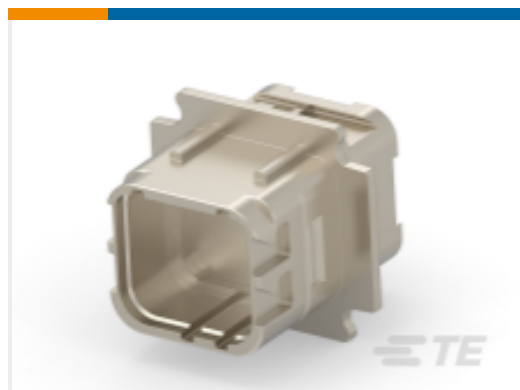
TE Part #ZPF000000000146309 Rectangular Connector Receptacle Extenders, Tool-less Assembly