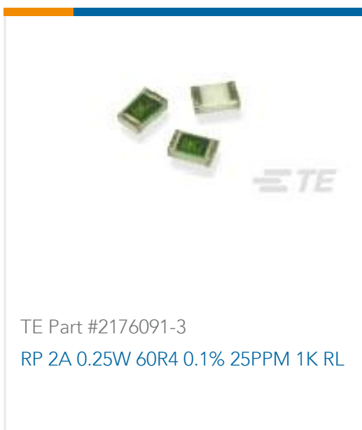
TE Part #2176091-3 RP 2A 0.25W 60R4 0.1% 25PPM 1K RL