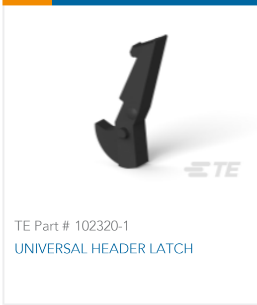
TE Part # 102320-1 UNIVERSAL HEADER LATCH