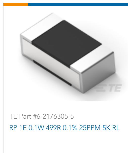
TE Part #6-2176305-5 RP 1E 0.1W 499R 0.1% 25PPM 5K RL