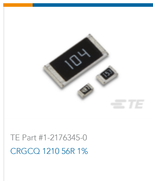
TE Part #1-2176345-0 CRGCQ 1210 56R 1%