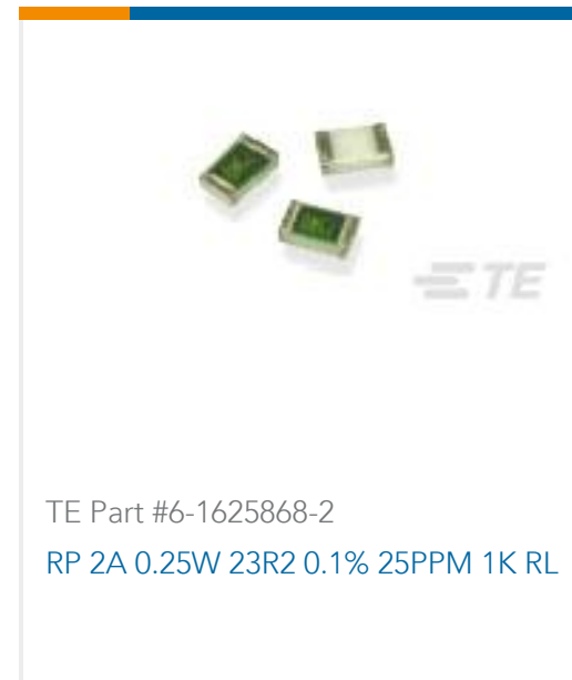
TE Part #6-1625868-2 RP 2A 0.25W 23R2 0.1% 25PPM 1K RL