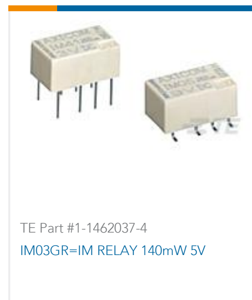
TE Part #1-1462037-4 IM03GR=IM RELAY 140mW 5V