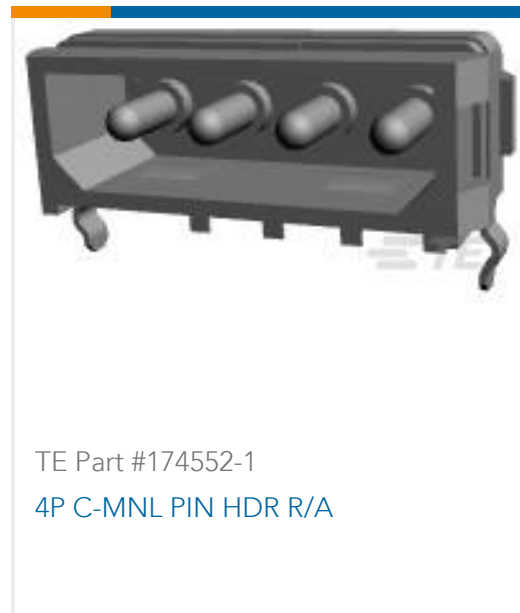
TE Part #174552-1 4P C-MNL PIN HDR R/A