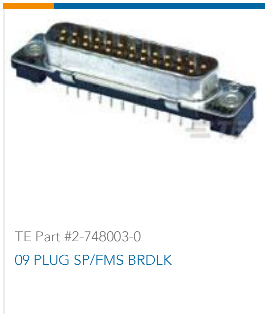
TE Part #2-748003-0 09 PLUG SP/FMS BRDLK