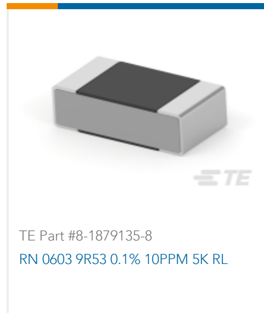
TE Part #8-1879135-8 RN 0603 9R53 0.1% 10PPM 5K RL