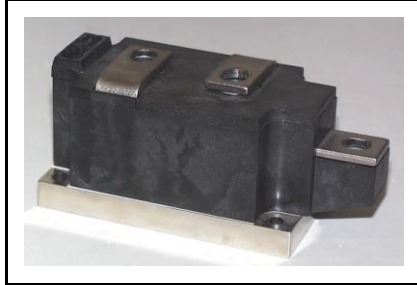
ND412235 Dual Diode Isolated POW-R-BLOK™ Module 200-350 Amperes / 2000-2200 Volts