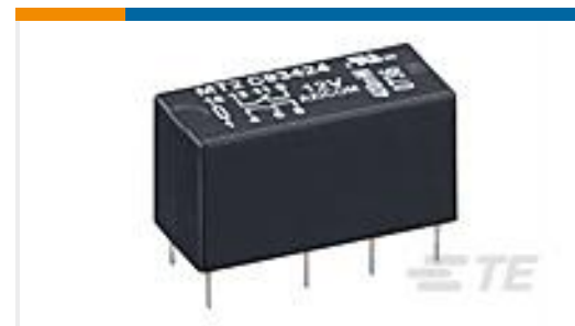
TE Part #4-1462000-1 C93419=MT RELAY 200 MW 24 V