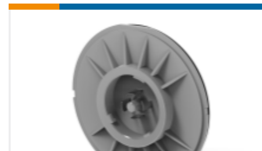
TE Part #2213831-2 BASE ASSY, 80MM, VENTED, SEALED