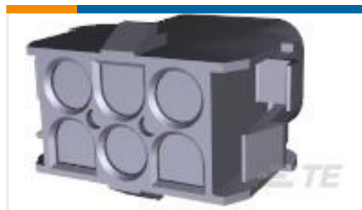
TE Part #1-480705-1 06P UMNL CAP HSG BRN