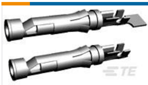
TE Part #66405-4 III+ SKT,30-26,30AU/FL,LP