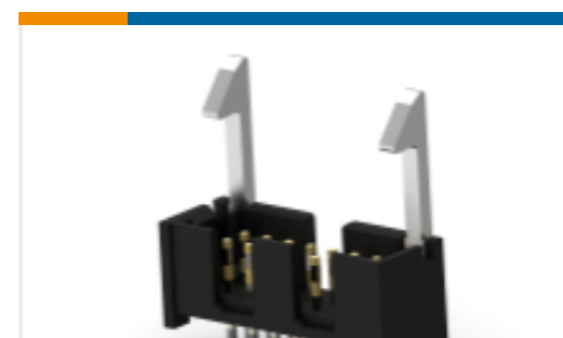
TE Part # 104128-2 014 LOPRO HDR SP 30DP LATCH