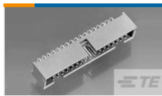
TE Part # 5104340-2 A/L LOW PRO HDR 14P RA HT