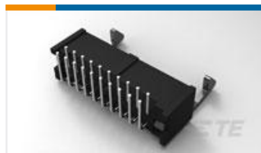
TE Part #2-1761607-5 IDC LOW PRO HDR 14P RA LG LAT