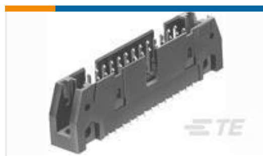
TE Part # 2-1761679-5 IDC LOW PRO HDR 14P VERT BLUE