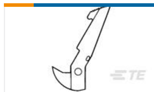
TE Part # 102320-3 A/L UNIV HDR EJT LATCH LG BLUE