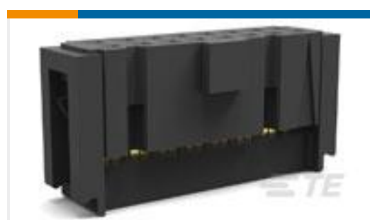
TE Part #2-1658527-8 622-3441LF=FSKT IDC S 34 30AU