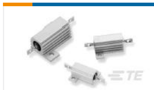
TE Part #1-1879074-0 THS15 2R2 5%