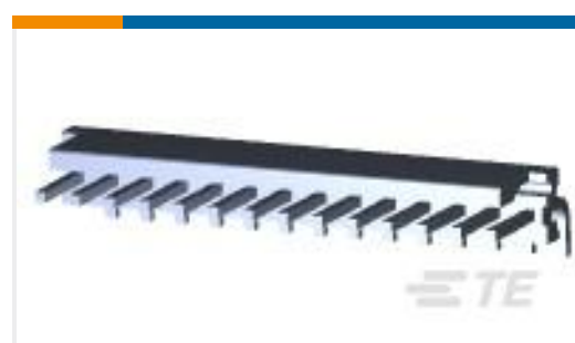
TE Part #1-640389-4 14P MTA156 HDR ASSY SQ R/A F/L