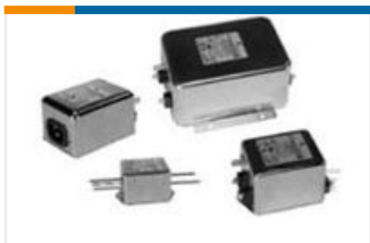
TE Part #1-6609053-1 15EHT1=F7669 S0