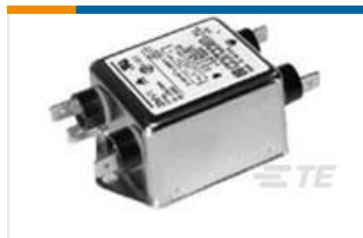
TE Part #6609056-3 10MV1=F7758 S0