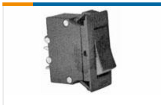
TE Part #1423673-5 W51-A121B1-10=CKTBKR,THERM,ROC