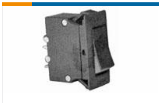
TE Part #3-1423673-9 W51-A152A1-5=CKTBKR,THERM,ROC