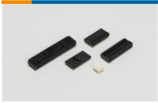
Wire-to-Board Connector Assemblies & Housings(142)