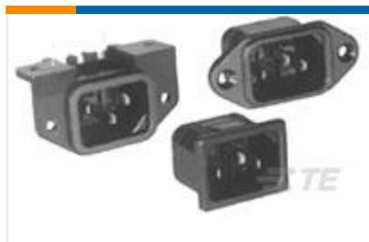
TE Part #1609133-3 6ESRM-3=F6920