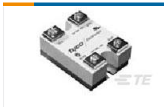
TE Part #2-1393030-2 SSRT-240D25 = PANEL MOUNT,25A, 240VAC