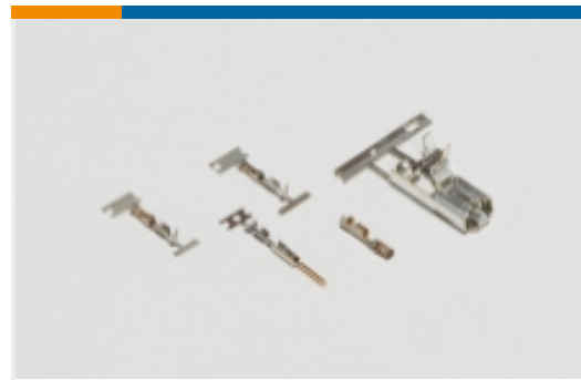
Wire-to-Board Connector Contacts(6)