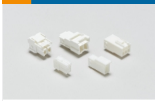
Rectangular Power Connectors(302)