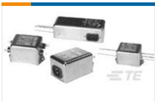
TE Part #6609054-1 3EHQ1=F7671 S0