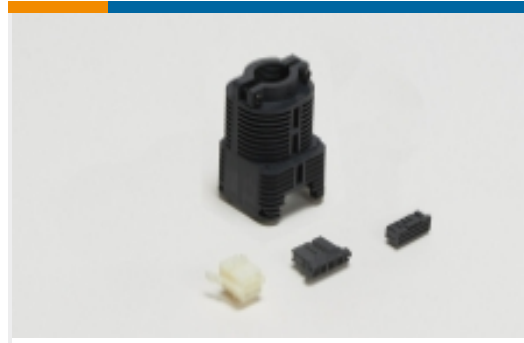
Rectangular Connector Housings(1)