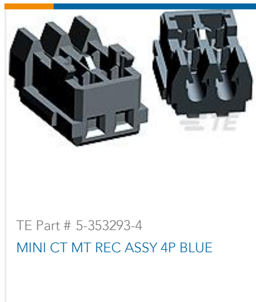
TE Part # 5-353293-4 MINI CT MT REC ASSY 4P BLUE