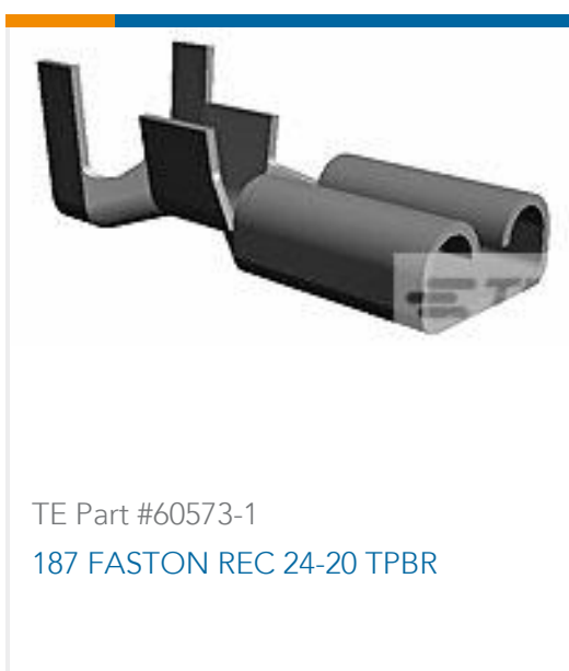
TE Part #60573-1 187 FASTON REC 24-20 TPBR