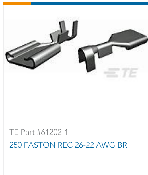
TE Part #61202-1 250 FASTON REC 26-22 AWG BR