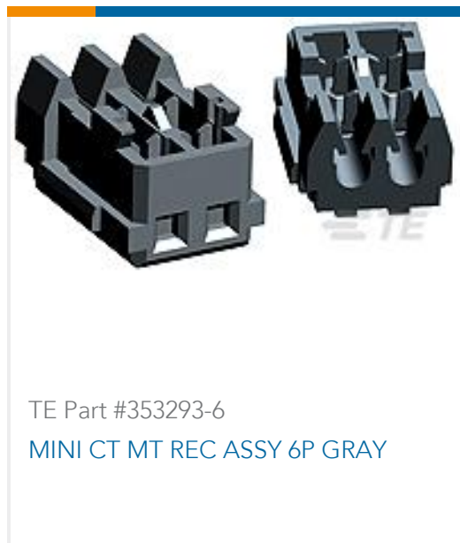
TE Part #353293-6 MINI CT MT REC ASSY 6P GRAY