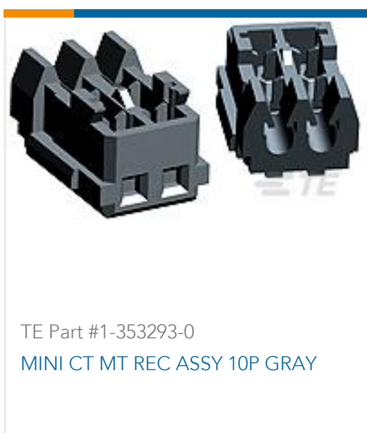
TE Part #1-353293-0 MINI CT MT REC ASSY 10P GRAY