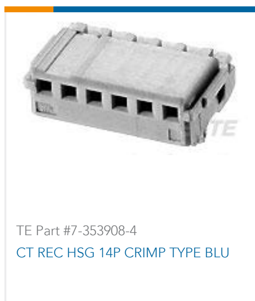
TE Part #7-353908-4 CT REC HSG 14P CRIMP TYPE BLU