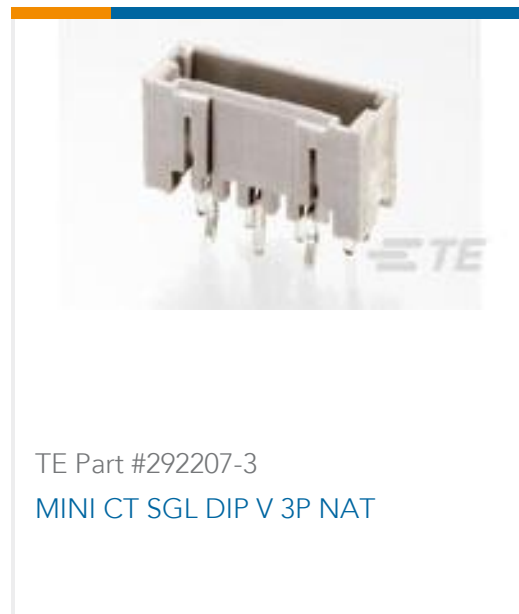
TE Part #292207-3 MINI CT SGL DIP V 3P NAT