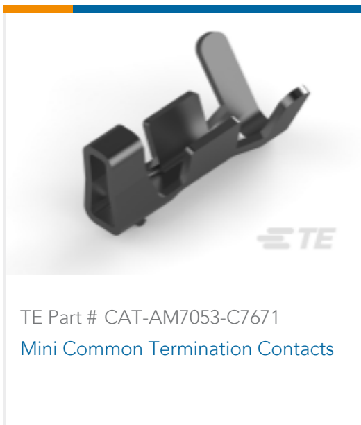
TE Part # CAT-AM7053-C7671 Mini Common Termination Contacts