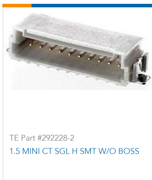
TE Part #292228-2 1.5 MINI CT SGL H SMT W/O BOSS