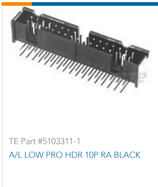
TE Part #5103311-1 A/L LOW PRO HDR 10P RA BLACK