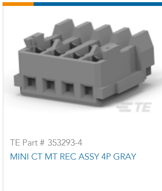
TE Part # 353293-4 MINI CT MT REC ASSY 4P GRAY