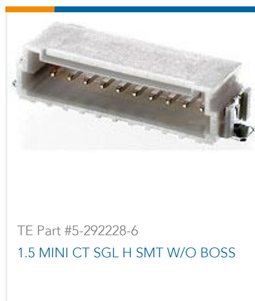
TE Part #5-292228-6 1.5 MINI CT SGL H SMT W/O BOSS