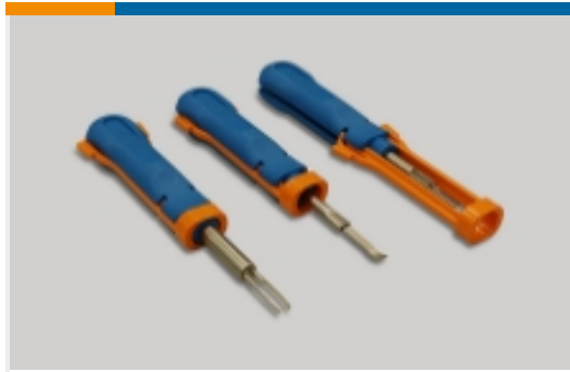
Insertion & Extraction Tools(2)