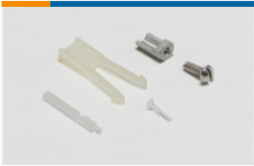
PCB Connector Keying(1)