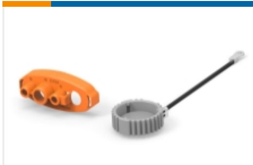
Connector Caps & Covers(69)