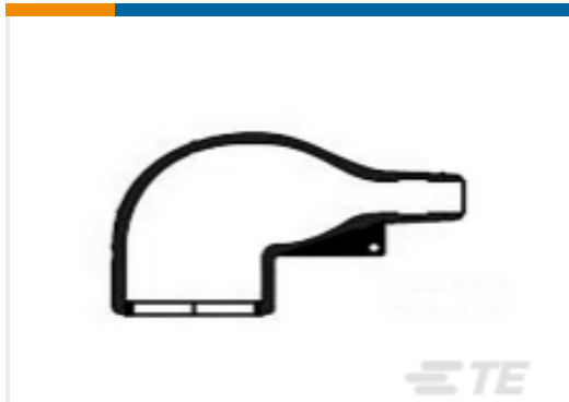
TE Part #EF9981-000 222K121-25L/225-0