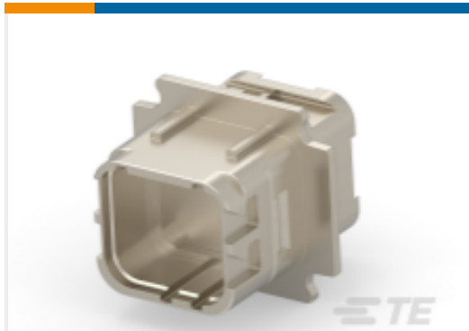
TE Part #ZPF000000000146309 Rectangular Connector Receptacle Extenders, Tool-less Assembly