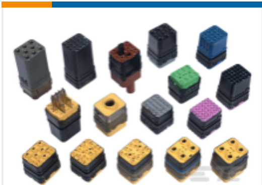
TE Part #ZPF000000000148762 DMC-M 99-04 AN (=33537-P0000)