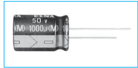
Marking color : White print on a black sleeve