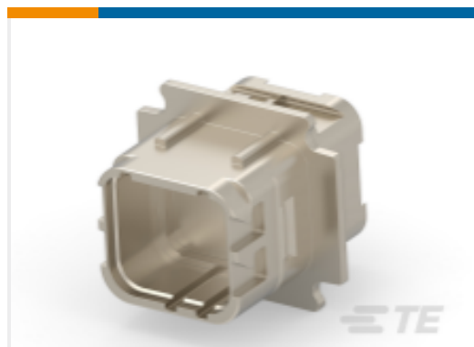
TE Part #ZPF000000000146309 Rectangular Connector Receptacle Extenders, Tool-less Assembly