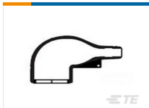
TE Part #EF9981-000 222K121-25L/225-0