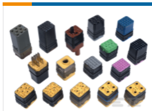
TE Part #ZPF000000000148762 DMC-M 99-04 AN (=33537-P0000)