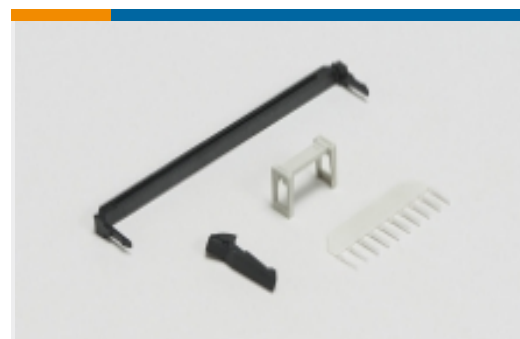
Ribbon Connector Accessories(13)