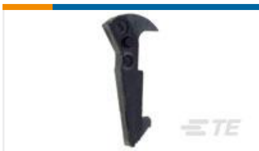
TE Part #102320-1 UNIVERSAL HEADER LATCH