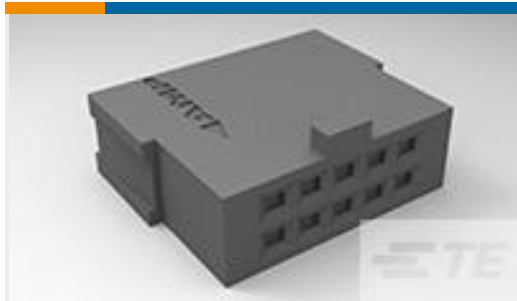
TE Part # 487223-9 034 HOUSING FFC RCPT 100CL DR