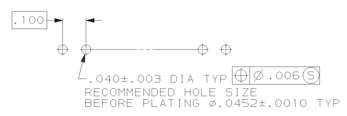
RECOMMENDED HOLE LAYOUT