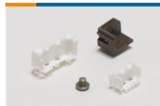
PCB Connector Mounting(8)