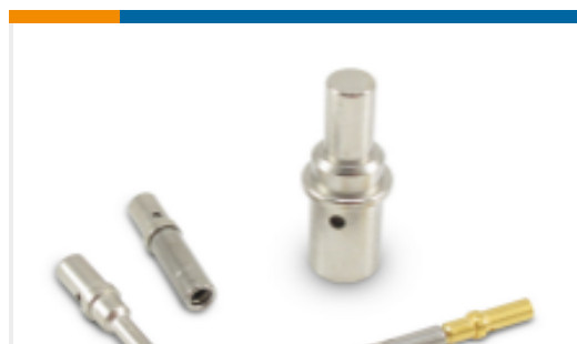
TE Part #0460-202-16141 DEUTSCH Solid Contacts