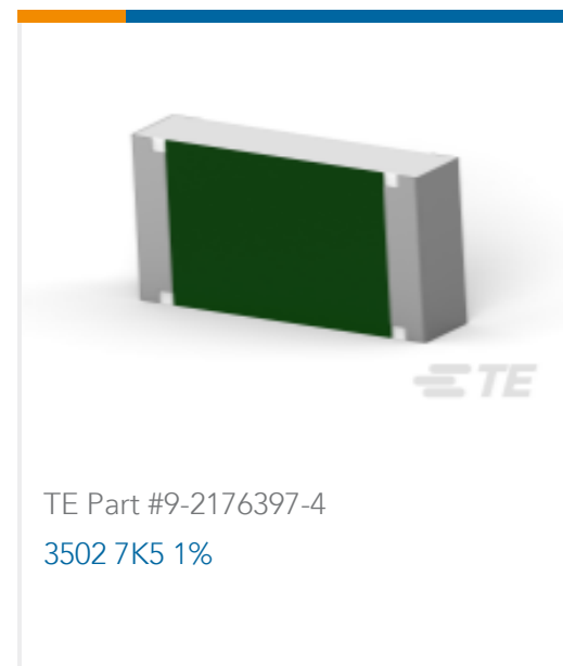
TE Part #9-2176397-4 3502 7K5 1%