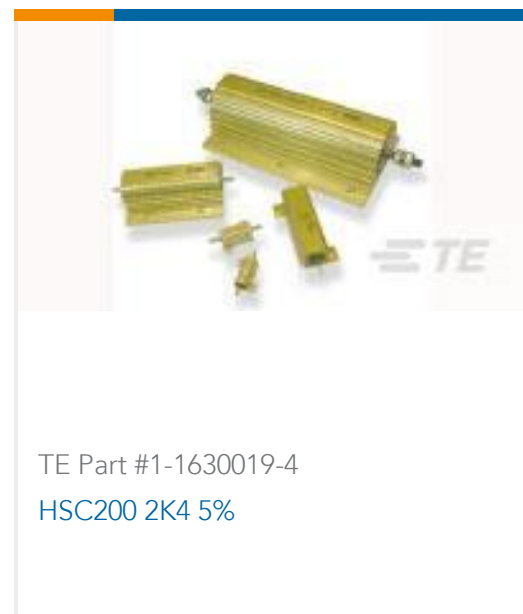
TE Part #1-1630019-4 HSC200 2K4 5%