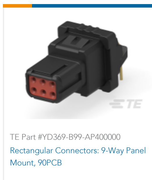
TE Part #YD369-B99-AP400000 Rectangular Connectors: 9-Way Panel Mount, 90PCB