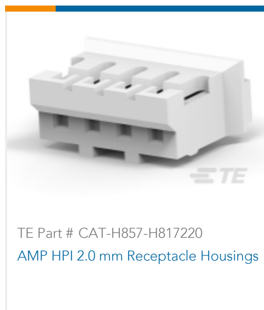
TE Part # CAT-H857-H817220 AMP HPI 2.0 mm Receptacle Housings