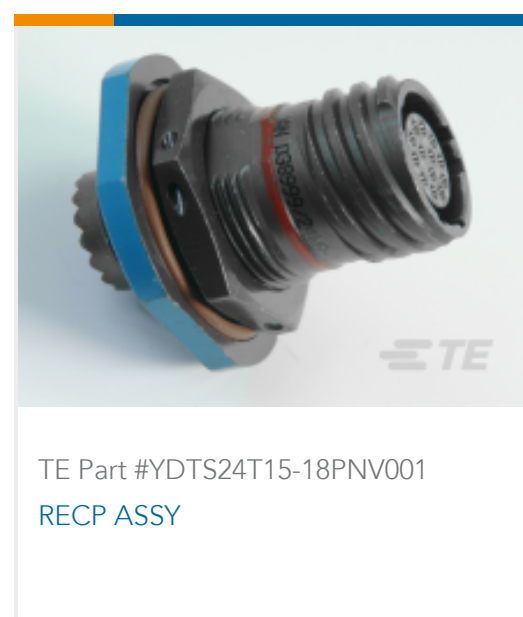
TE Part #YDTS24T15-18PNV001 RECP ASSY