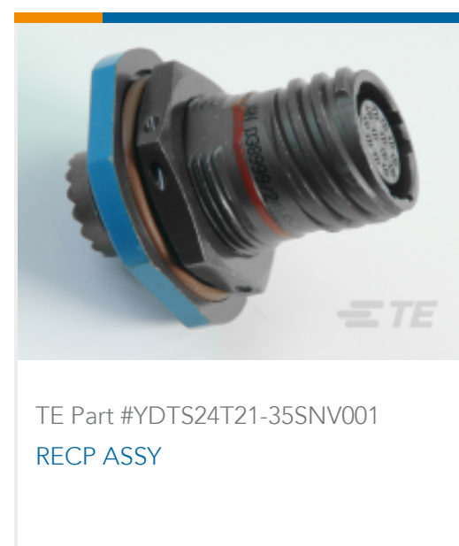
TE Part #YDTS24T21-35SNV001 RECP ASSY