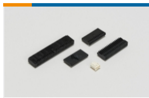
Wire-to-Board Connector Assemblies &amp; Housings(139)