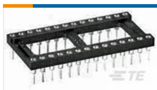
TE Part #2-1571586-9 828-AG11D-LF=800 DIP,PCB,AU/SN