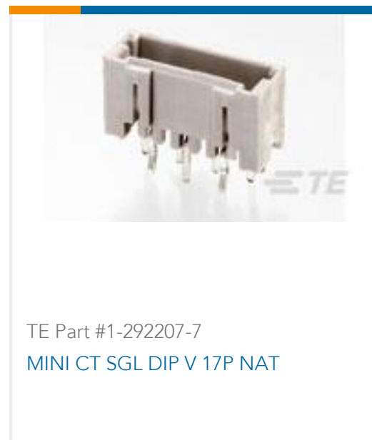
TE Part #1-292207-7 MINI CT SGL DIP V 17P NAT