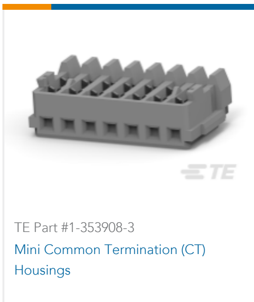
TE Part #1-353908-3 Mini Common Termination (CT) Housings