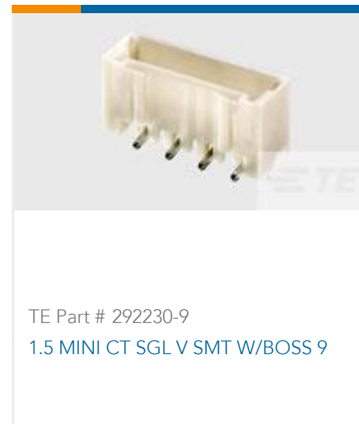
TE Part # 292230-9 1.5 MINI CT SGL V SMT W/BOSS 9