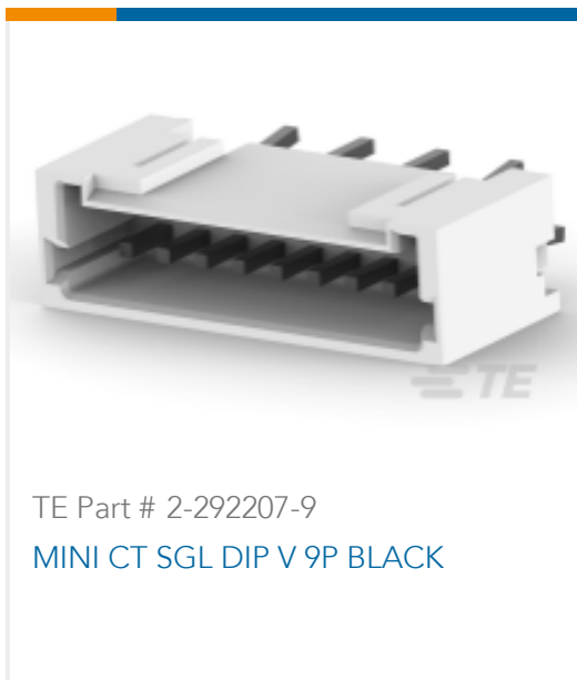
TE Part # 2-292207-9 MINI CT SGL DIP V 9P BLACK