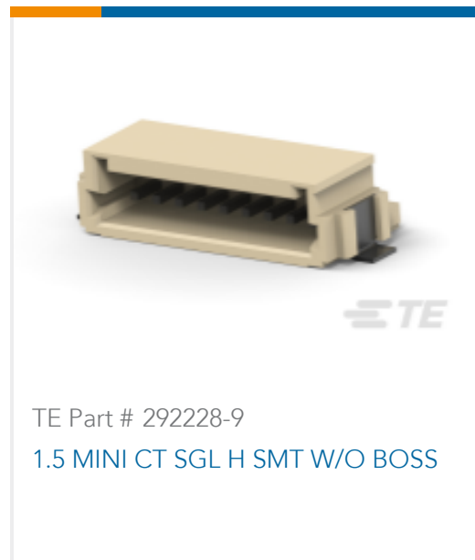
TE Part # 292228-9 1.5 MINI CT SGL H SMT W/O BOSS