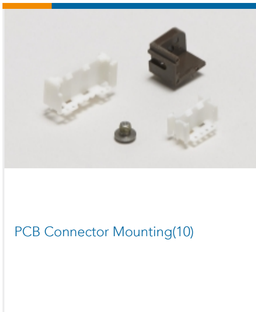
PCB Connector Mounting(10)