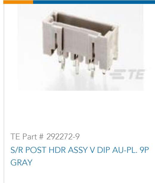
TE Part # 292272-9 S/R POST HDR ASSY V DIP AU-PL. 9P GRAY