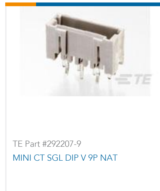
TE Part #292207-9 MINI CT SGL DIP V 9P NAT