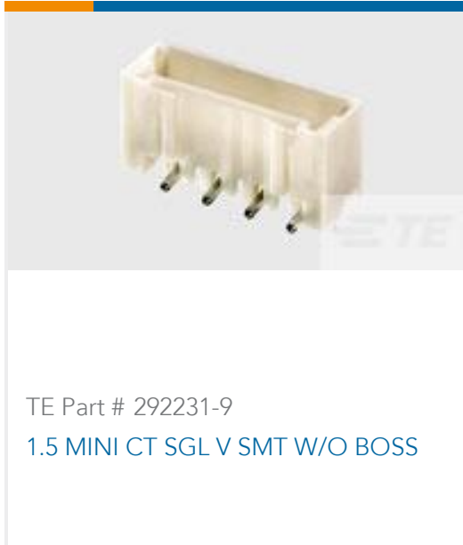
TE Part # 292231-9 1.5 MINI CT SGL V SMT W/O BOSS