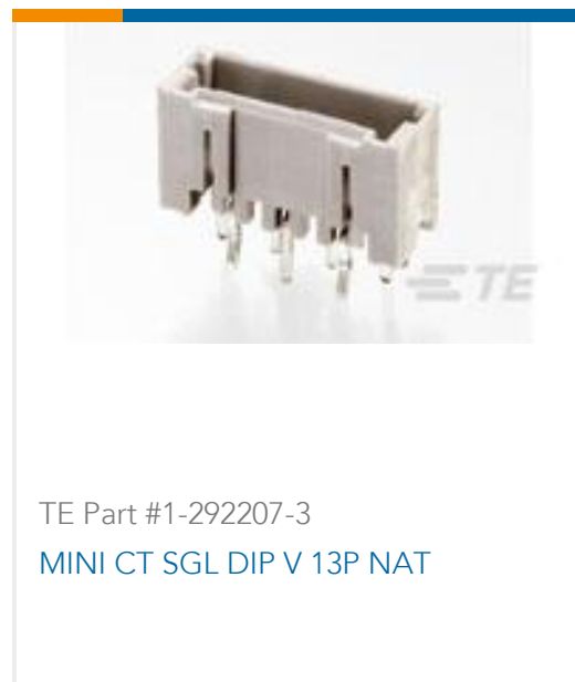
TE Part #1-292207-3 MINI CT SGL DIP V 13P NAT