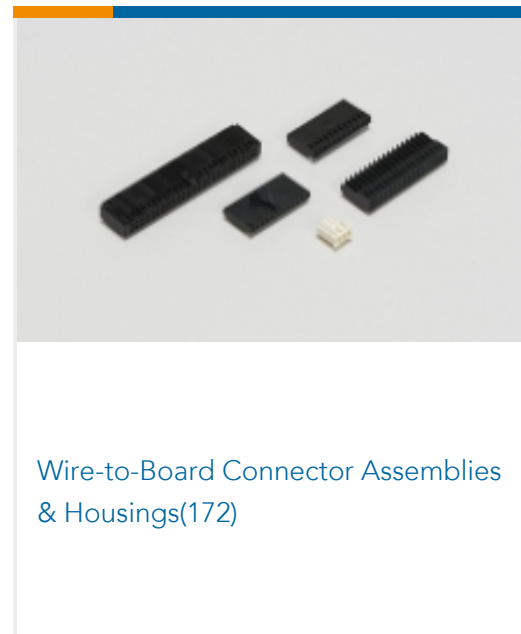
Wire-to-Board Connector Assemblies & Housings(172)