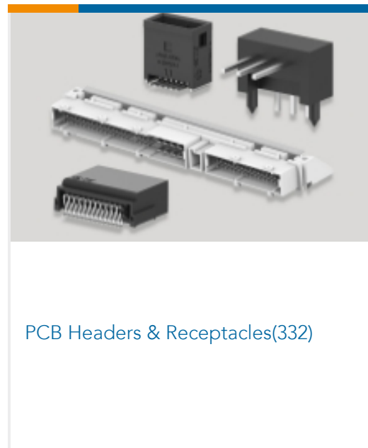
PCB Headers & Receptacles(332)