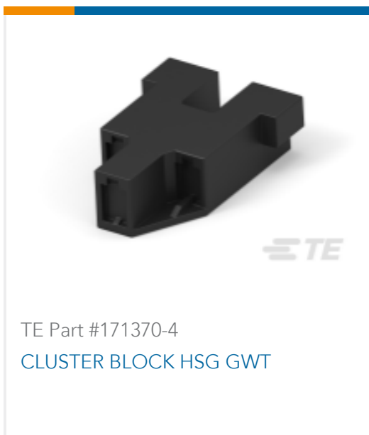
TE Part #171370-4 CLUSTER BLOCK HSG GWT