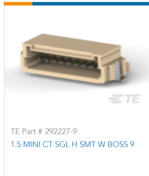
TE Part # 292227-9 1.5 MINI CT SGL H SMT W BOSS 9