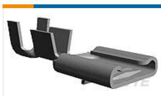
TE Part #160920-4 FF 312 REC 2.5-4MM2 TPPB