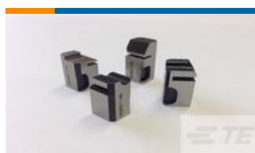
TE Part #318059-8 FLOATING SHEAR, FRONT