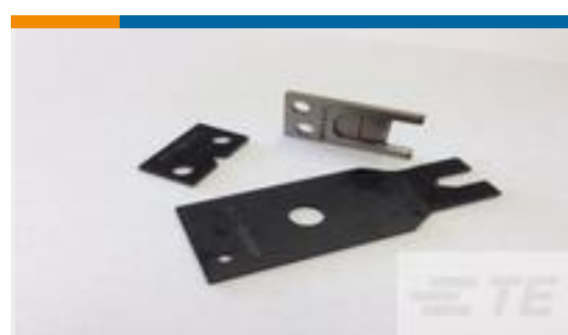
TE Part #1-2217206-5 Blade, Slug