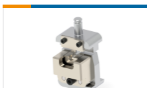
TE Part #2358638-1 DIE SET DIA 6MM T 6MM2