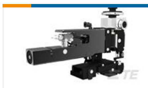
TE Part #2151279-2 OCEAN_2.0_APPLICATOR-S-080F1000