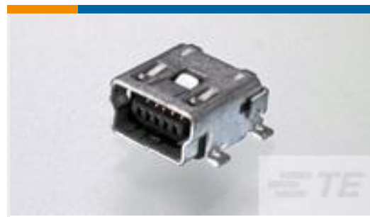
TE Part #1-1734035-1 MINI USB, TYPE B, R/A, SMT