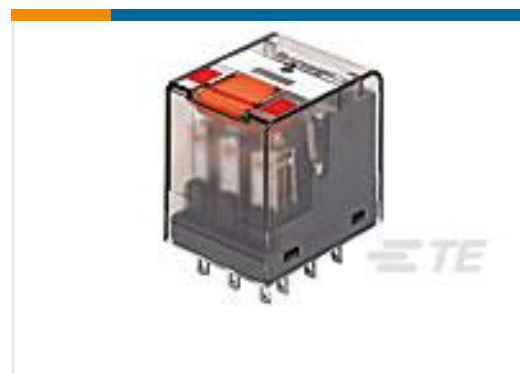
TE Part #3-1415020-1 PT570N20