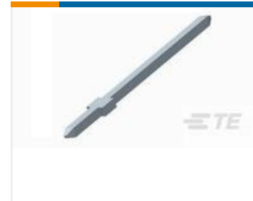
TE Part #1-928836-2 MOD2 PIN WITH A-PIN L/P