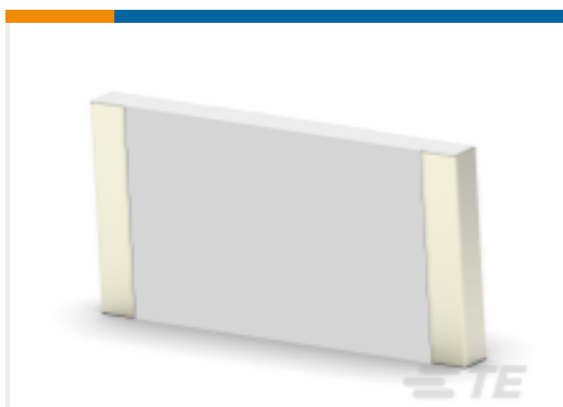
TE Part #7-2176246-6 CRGS2512 5% 1M8