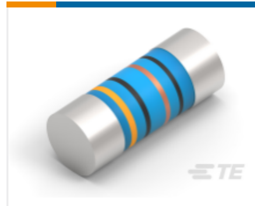
TE Part #2176314-4 MELF SMA_A 180R 0.1% 15PPM 0102 0.3W