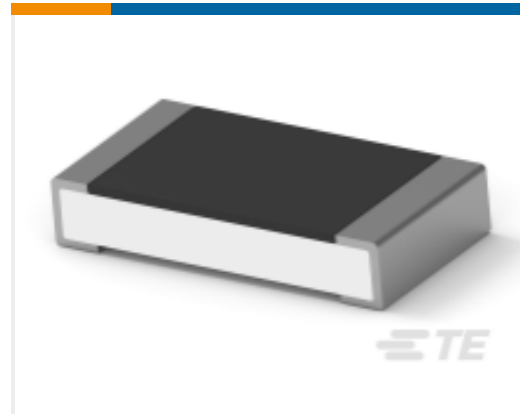
TE Part #4-2176391-7 RQ 1206 37K4 0.1% 10PPM 5K RL