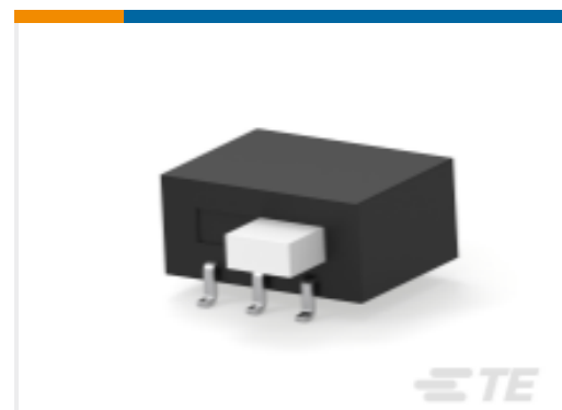
TE Part #1-1437581-1 ASE22RL=AUTOSLIDE DP