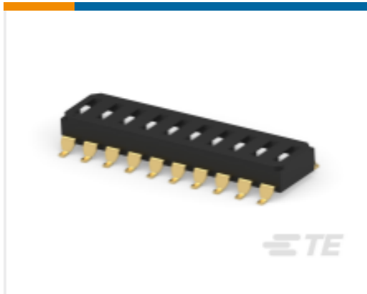
TE Part #3-2319848-1 END STACK DIP 10P G RECESS SEAL TUBE