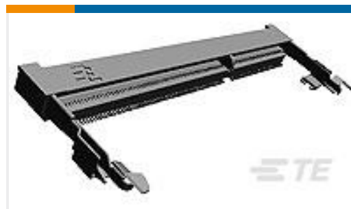
TE Part #2-2013310-1 EMBOSS TAPE DDR3 204P 9.2H STD