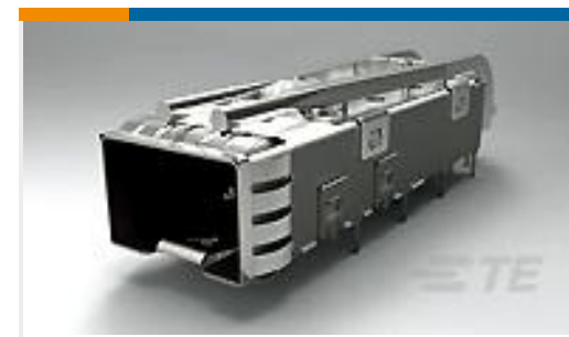
TE Part #2170193-1 SFP+ 1x1 Cage Assembly,w/ Light Pipe