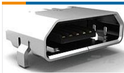
TE Part #1932788-1 MICRO USB, TYPE B, REVERSE