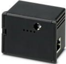
Ethernet communication module for the EEM-MA600 with integrated web server

Please be informed that the data shown in this PDF Document is generated from our Online Catalog. Please find the complete data in the user's documentation. Our General Terms of Use for Downloads are valid ( http://phoenixcontact.com/download )