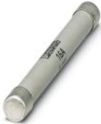
Fuse, 10.3 mm x 85 mm, up to 1500 V DC, gPV characteristic

Please be informed that the data shown in this PDF Document is generated from our Online Catalog. Please find the complete data in the user's documentation. Our General Terms of Use for Downloads are valid ( http://phoenixcontact.com/download )