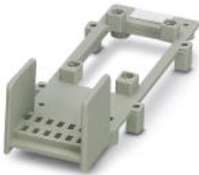
Plug receptacle, for plug assembly board, with strain relief, for accommodating contact inserts, type HC-B 10

Please be informed that the data shown in this PDF Document is generated from our Online Catalog. Please find the complete data in the user's documentation. Our General Terms of Use for Downloads are valid ( http://phoenixcontact.com/download )