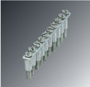
Fixed bridge, pitch: 5 mm, number of positions: 10, color: silver

Please be informed that the data shown in this PDF Document is generated from our Online Catalog. Please find the complete data in the user's documentation. Our General Terms of Use for Downloads are valid ( http://phoenixcontact.com/download )