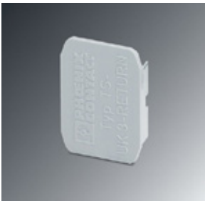
Separating plate, width: 0.5 mm, color: gray

Please be informed that the data shown in this PDF Document is generated from our Online Catalog. Please find the complete data in the user's documentation. Our General Terms of Use for Downloads are valid ( http://phoenixcontact.com/download )