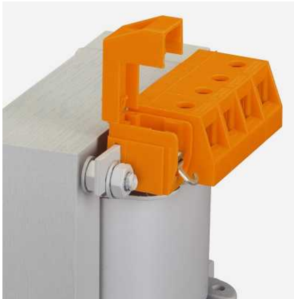
Transformer terminal block, single terminal block version