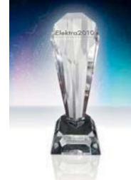
Elektra Award 2010