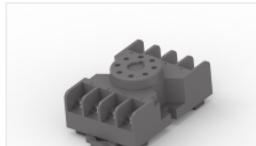
TE Part #2-1419106-3 27E891=SOCKET,KRPA,8,OCTAL,POL