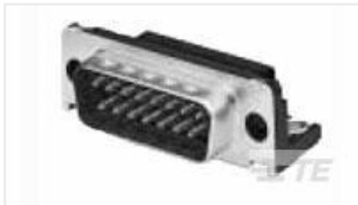
TE Part #5747238-6 25 MSFL PLUG RA 318 (SL,FM)