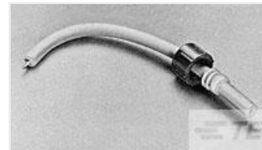
TE Part #1-839564-3 LEAD, SGL END ASSY, LGH