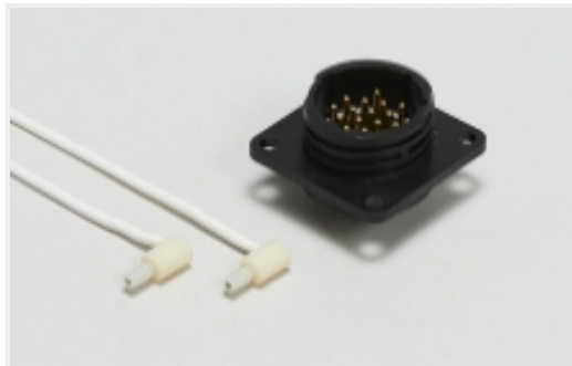
Circular Power Connectors(91)