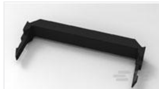
TE Part #499252-8 016 STRAIN RELIEF A-L RCPT