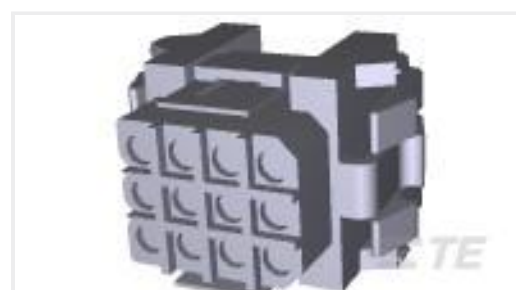
TE Part #207017-1 METRIMATE PLUG, 12 POS