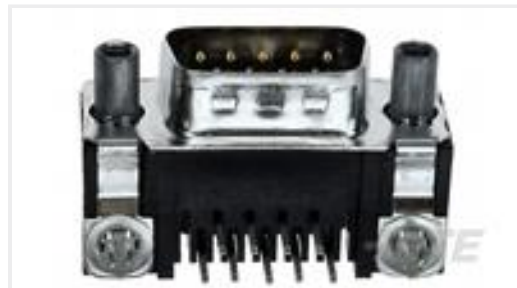
TE Part #5747843-6 37 MSFL PLUG RA 318 (SL,FM,BL)