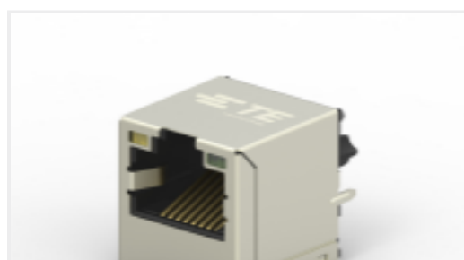
TE Part #2301995-4 RJ45 JACK INT.MAG. 1GB LED 1X1 VERT.