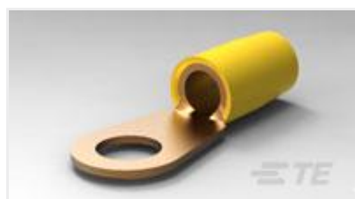
TE Part #324052 TERMINAL,T-N R 4 3/8