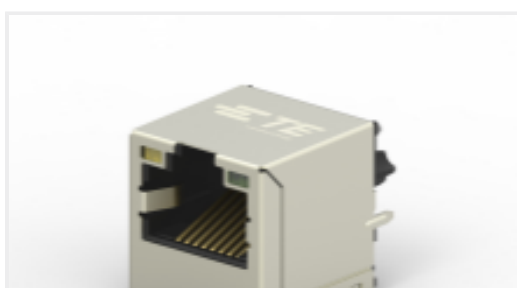
TE Part #5-2301995-4 RJ45 JACK INT.MAG. 1GB LED 1X1 VERT.