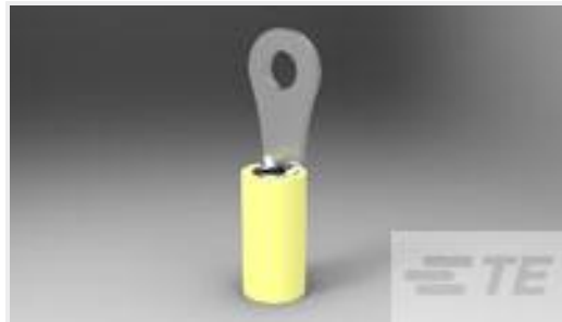
TE Part #35148 TERMINAL,PIDG R 12-10 4