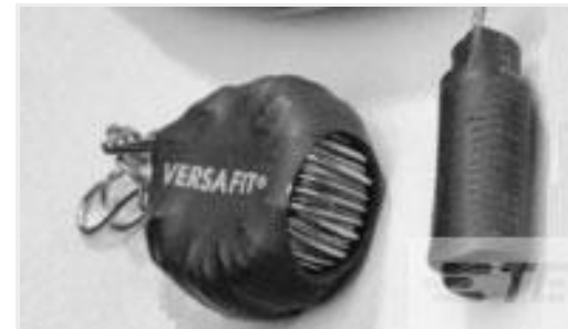
TE Part #F27156-000 VERSAFIT-MINI-SPL-1-BK