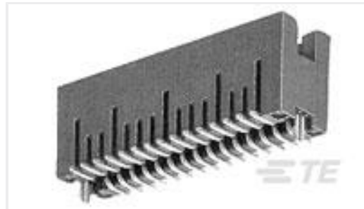
TE Part #5-104656-5 50 50/50 HDR DRST SFMNT.320 SN