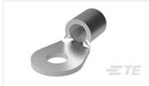
TE Part #33466-1 TERMINAL,SOLIS R 6 5/16 90DEG