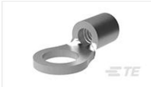
TE Part #34892 TERMINAL,BUDG R 12-10 6