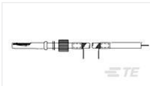
TE Part #2-846985-8 LGH 1/2 SGL MLD END/BRD/GND