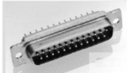
TE Part #1757820-7 AMPLIMITE,ASY,RCPT,STD,109,ZN,2,CT