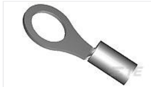
TE Part #323170 TERMINAL,SOLIS R HR 6 1/4