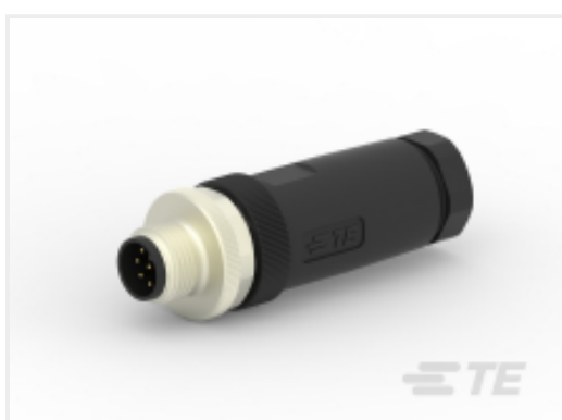
TE Part #T4111001081-000 M12,MALE,STRAIGHT,A CODE,8P, PG7,GOLD