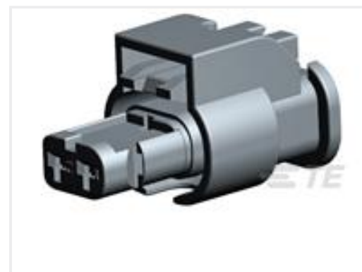
TE Part #2-1670916-1 2POS, MCON 1.2 LL REC SEALED