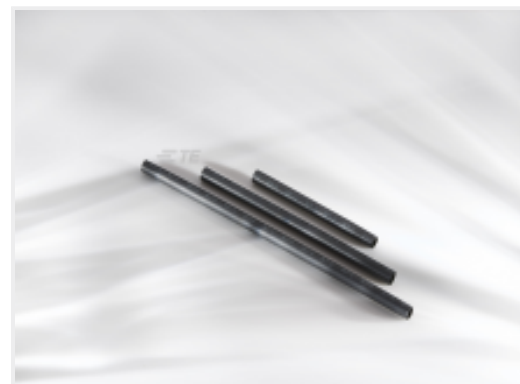
TE Part #537637P041 SCT-NO.3-E3-0-STK