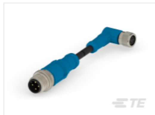
TE Part #T4052415004-001 RPC-M8-4FR-0.5-M12-4MS-PVC