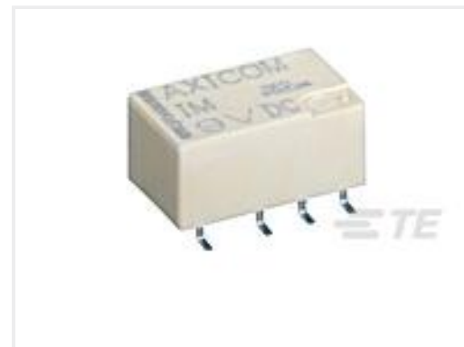
TE Part #1462041-3 IMB06CGR=IM RELAY 140mW 12V HDV