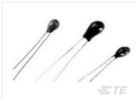
TE Part #11032563-00 44006RC,THERM,ROHS