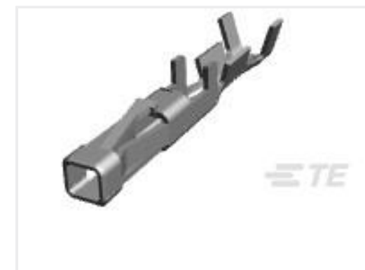
TE Part #1-794611-1 MICRO MNL RPT CNT,LS PC,15AU,L