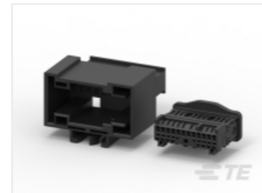
TE Part #2141404-1 MQS, CONNECTOR HOUSING