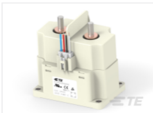
TE Part #1-2071582-2 ECP600BHBADB