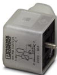
Valve connectors, 3-position, Valve connector A, with 1 LED, connected with Varistor, Screw connection, Cable gland Pg9, External cable diameter 6 mm ... 8 mm

Please be informed that the data shown in this PDF Document is generated from our Online Catalog. Please find the complete data in the user's documentation. Our General Terms of Use for Downloads are valid ( http://phoenixcontact.com/download )