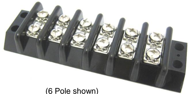
(6 Pole shown)