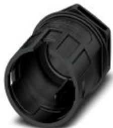
Circular connectors (device-side), Device connector, front mounting, Housing material: PPE, color: black, nom. voltage: 690 V AC

Please be informed that the data shown in this PDF Document is generated from our Online Catalog. Please find the complete data in the user's documentation. Our General Terms of Use for Downloads are valid ( http://phoenixcontact.com/download )